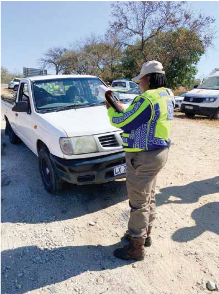
Limpopo law enforcement officers checking on the conditions of vehicles and drunken drivers during the ongoing Phuza Weekend Operation, which is conducted across the province.