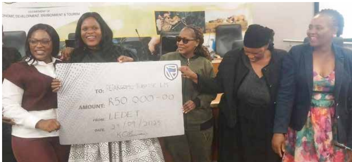
FTLM was awarded R50 000-00 prize after it was named the Greenest Municipality in Sekhukhune District.