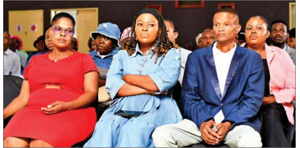
Various stakeholders attended the EPMLM MPAC Public Hearing held at Municipal Town Hall in Marble Hall.

MARBLE HALL - The Ephraim Mogale Local Municipality (EPMLM) has on Monday 29 September 2025 held a Municipal Public Accounts Committee (MPAC) Public Hearing on its fourth-quarter performance for the 2024/2025 financial year.