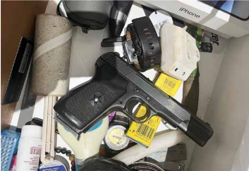
Unlicensed firearms and ammunition were recovered by the police during the high-density Operation Shanela.