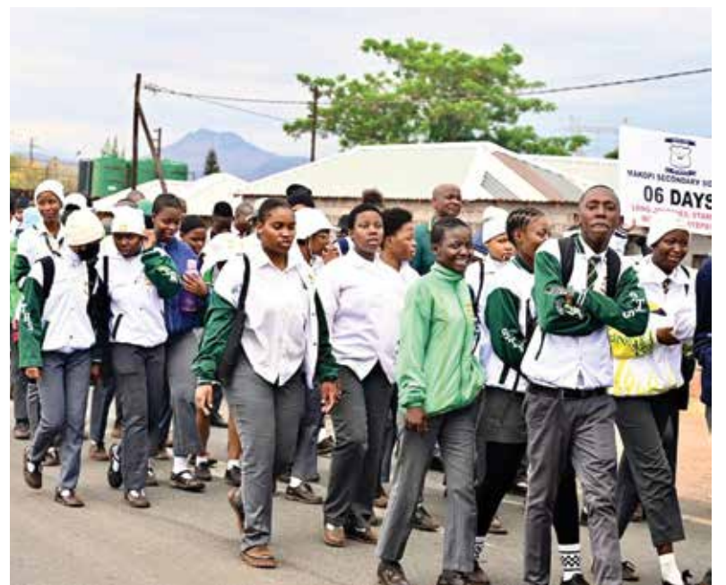
About 1500 matric learners from the Sekhukhune East Education District participated in the Matric Solidarity Walk during the launching of the 2025 Matric Examination Countdown by Limpopo Premier Dr Phophi Ramathuba.

Ramathuba concluded by wishing learners strength, focus, and confidence as they take on their final stretch. "Your moment is here, seize it," she said.