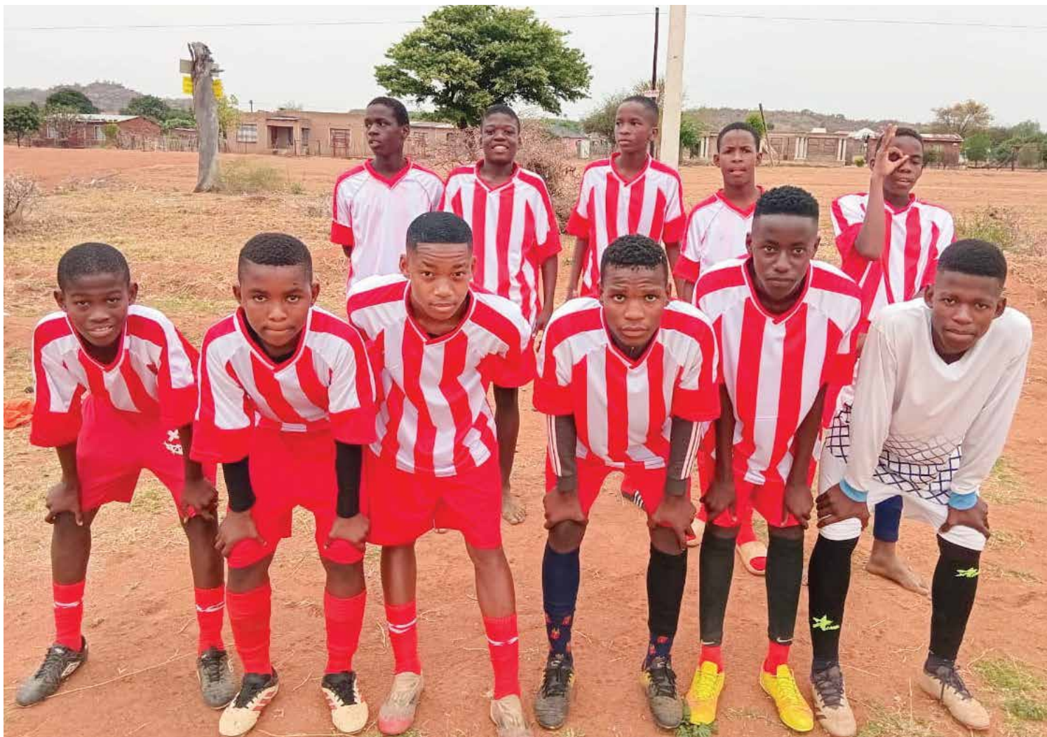
Bakone Small Boys from Moganyaka Village thrashed Avengers FC 4-0 in the BSDA Super League encounter played at Rest in Peace Sports Grounds in Mamphokgo Village on Sunday 28 September 2025.

"What we are still struggling with is time because these small boys don't be in time during the games," he said, adding