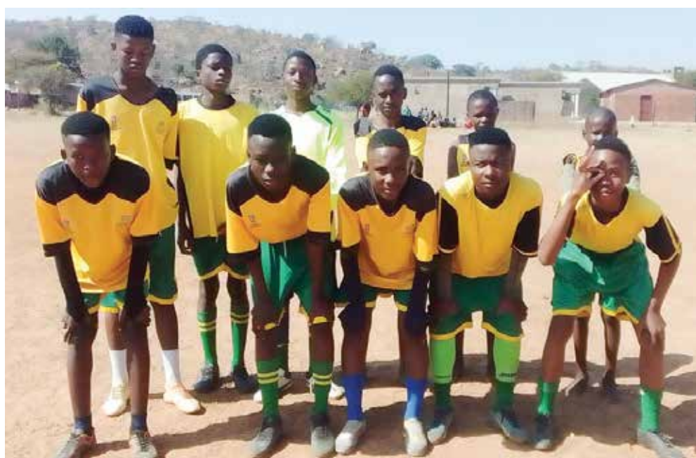
Bakone Small Boys from Moganyaka Village thrashed Avengers FC 4-0 in the BSDA Super League encounter played at Rest in Peace Sports Grounds in Mamphokgo Village on Sunday 28 September 2025.