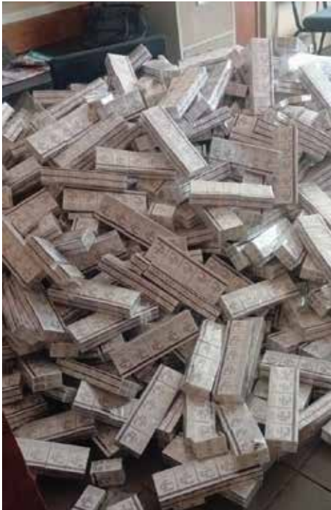
Various drugs were recovered by the police during Operation Shanela, conducted between Sunday 21 and Sunday 28 September 2025 across Limpopo Province.