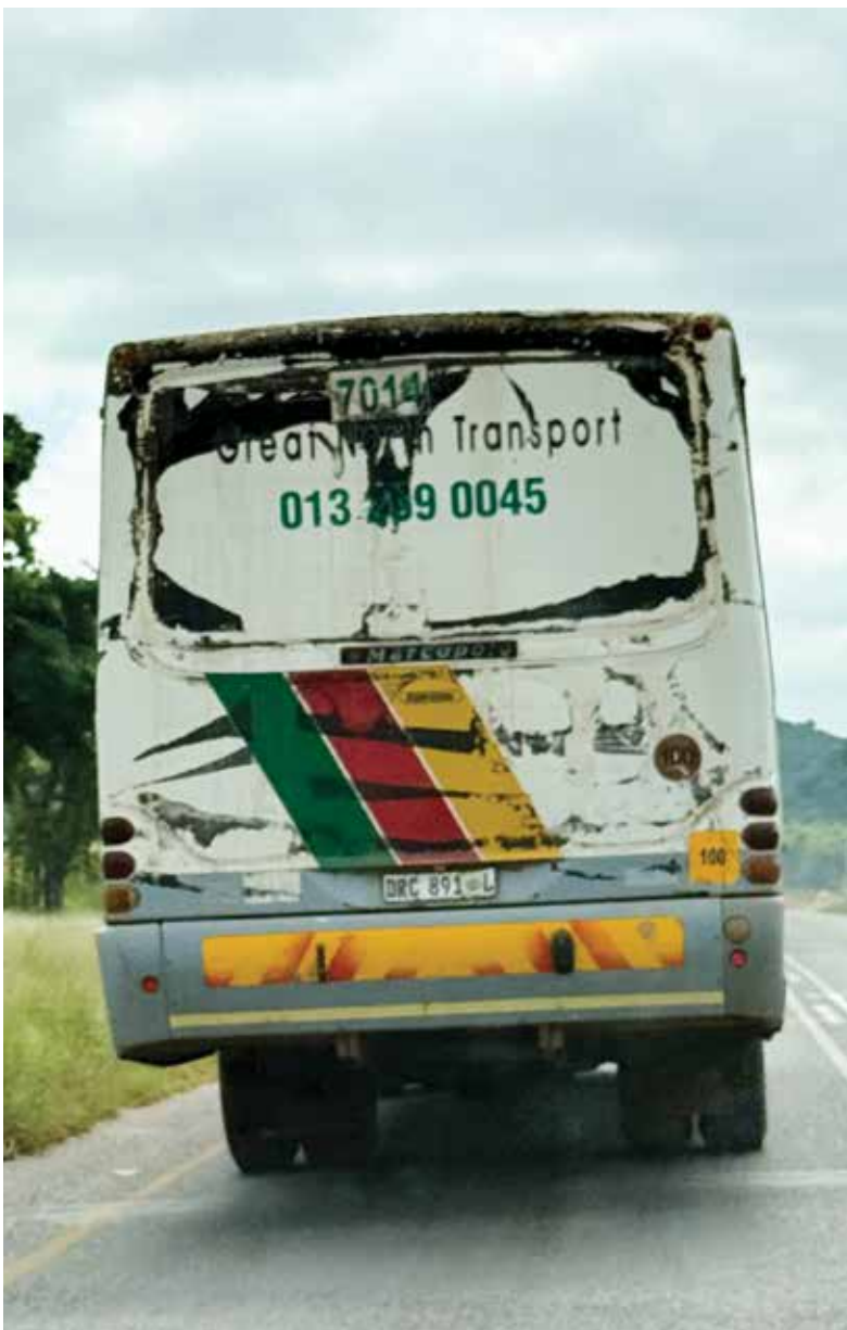
The DA in Limpopo has demanded the GNT Board and the LEDET to void alleged irregular tenders awarded for hiring buses following procurement findings by the AG.