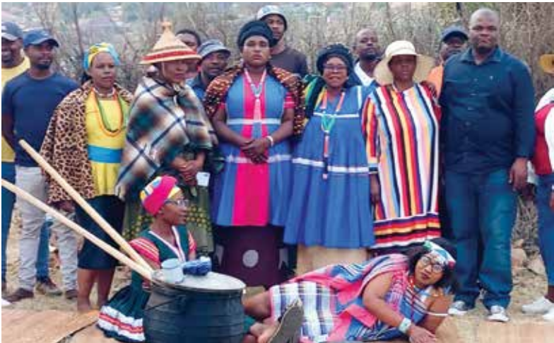
Residents of Molepane Village dressed in colourful traditional attire during Heritage Day commemoration organized at Molepane Royal Kraal.