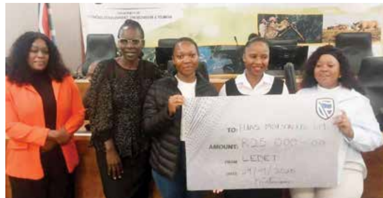
EMLM walked away with R25 000-00 after obtaining the third position as one of The Greenest Municipality in Sekhukhune District.